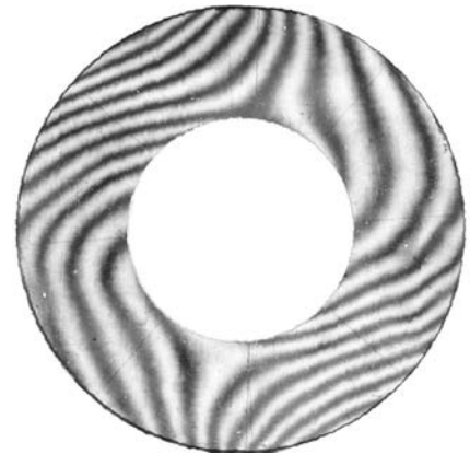
Geometric moiré pattern for a ring in diametral compression obtained during a student lab demonstration using 500 lines/inch gratings with a transparent plastic specimen. Pitch mismatch, rotation, and strain affect the pattern. Photo by Gary Cloud, ca. 1970.

Parametric analysis of moiré fringes is undertaken to: